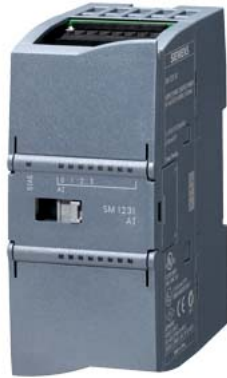
SIMATIC S7-1200, Analog input, SM 1231 TC, 8 AI thermocouples